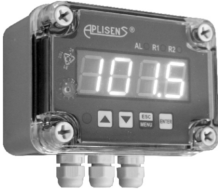
M12x1,5 cable gland